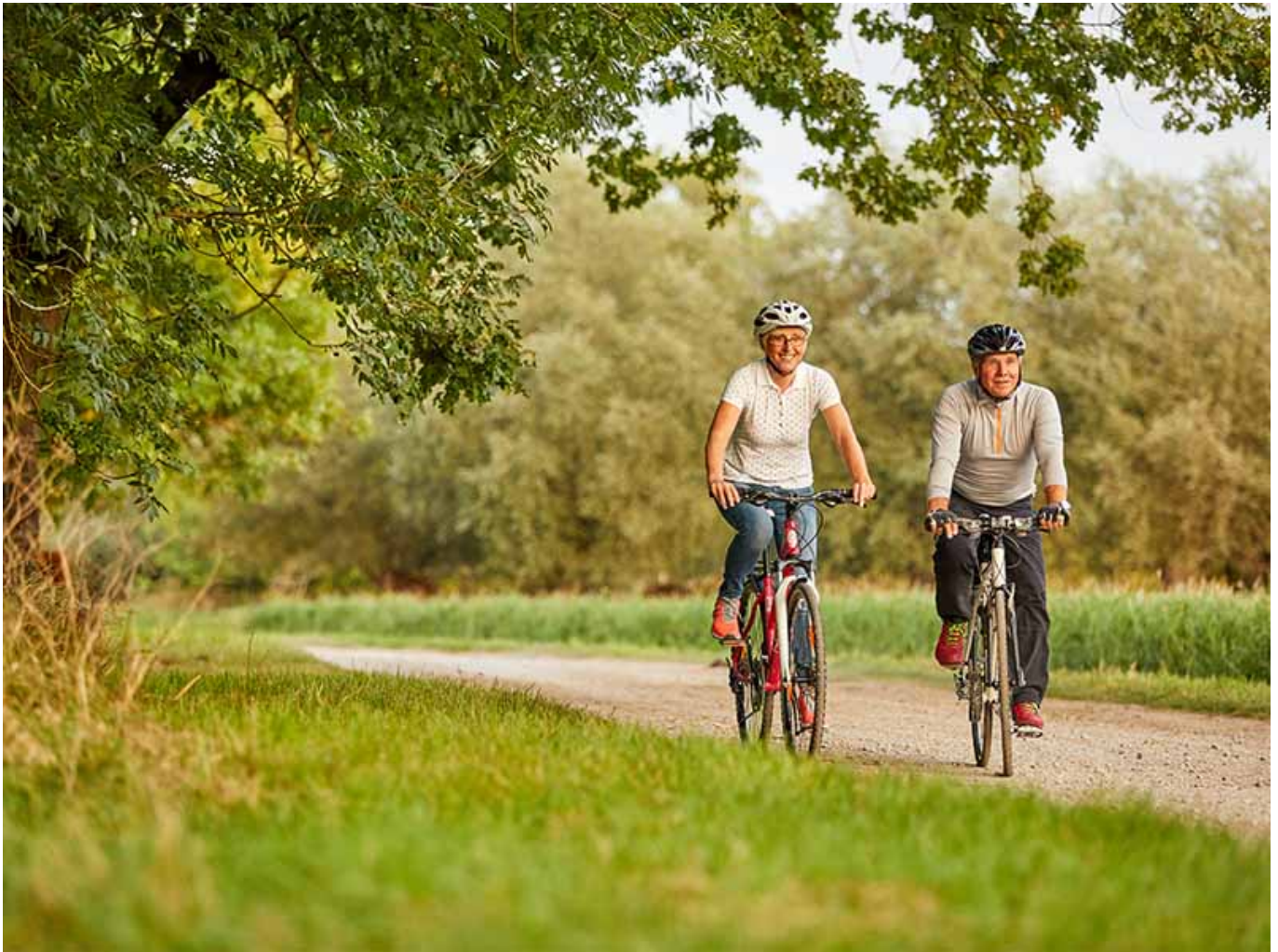
Unstrut Cycle Path