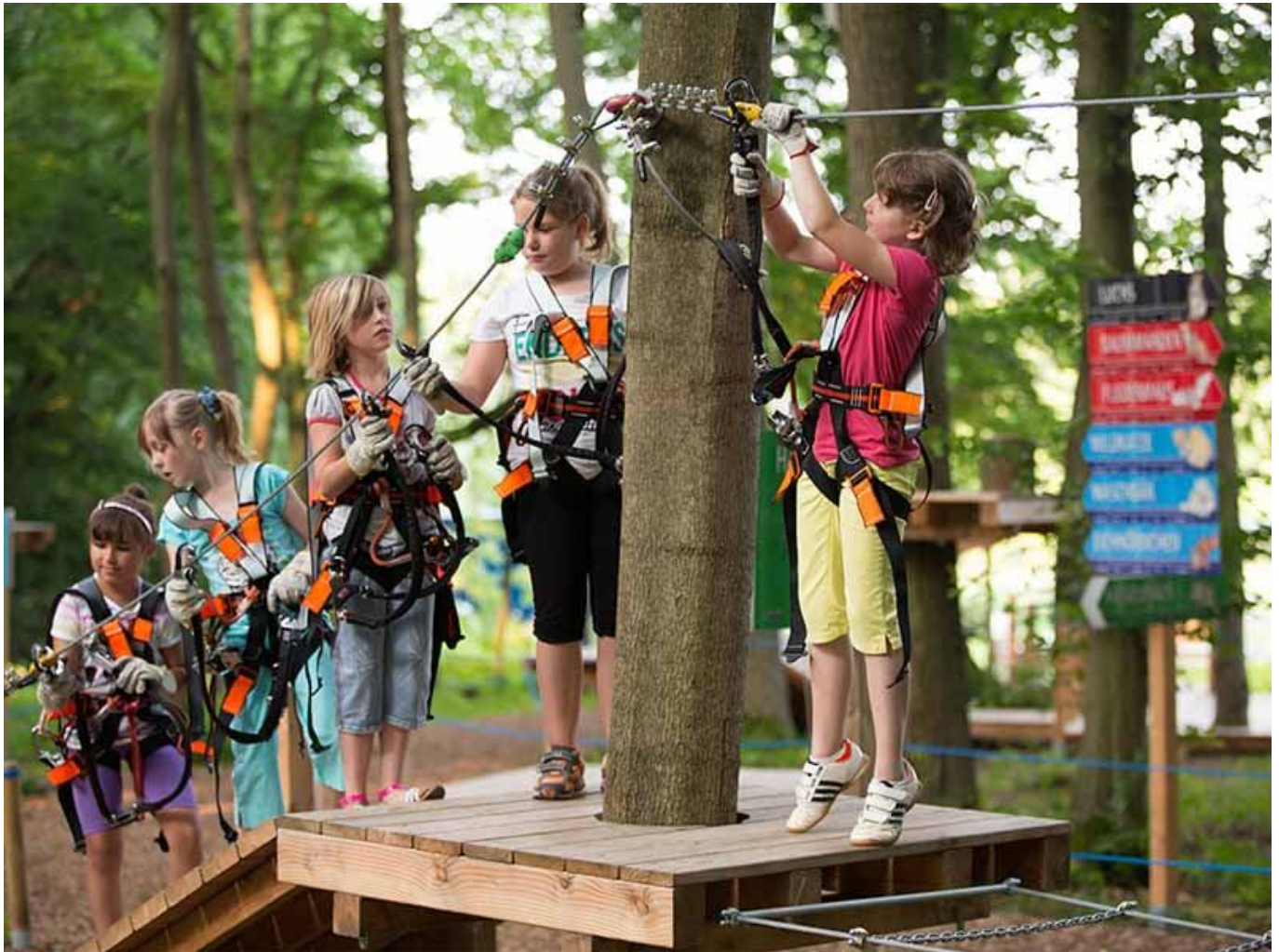
Klimbos Hainich

This is a destination for courageous people in the World Heritage site: The Hainich High Rope Course. With 120 climbing elements in ten courses, it guarantees a lot of action, fun and adventure.