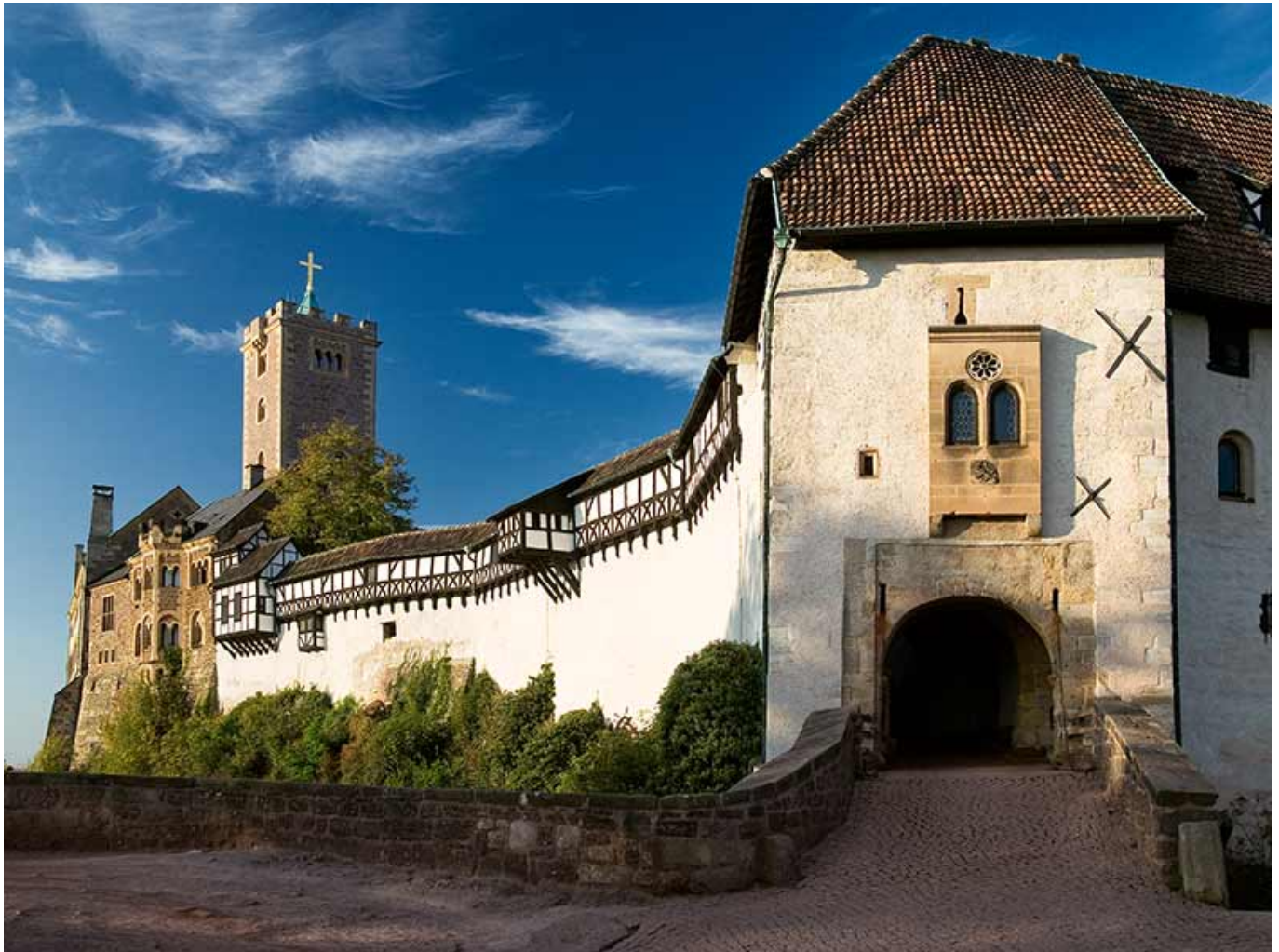
UNESCO Welterbe Wartburg