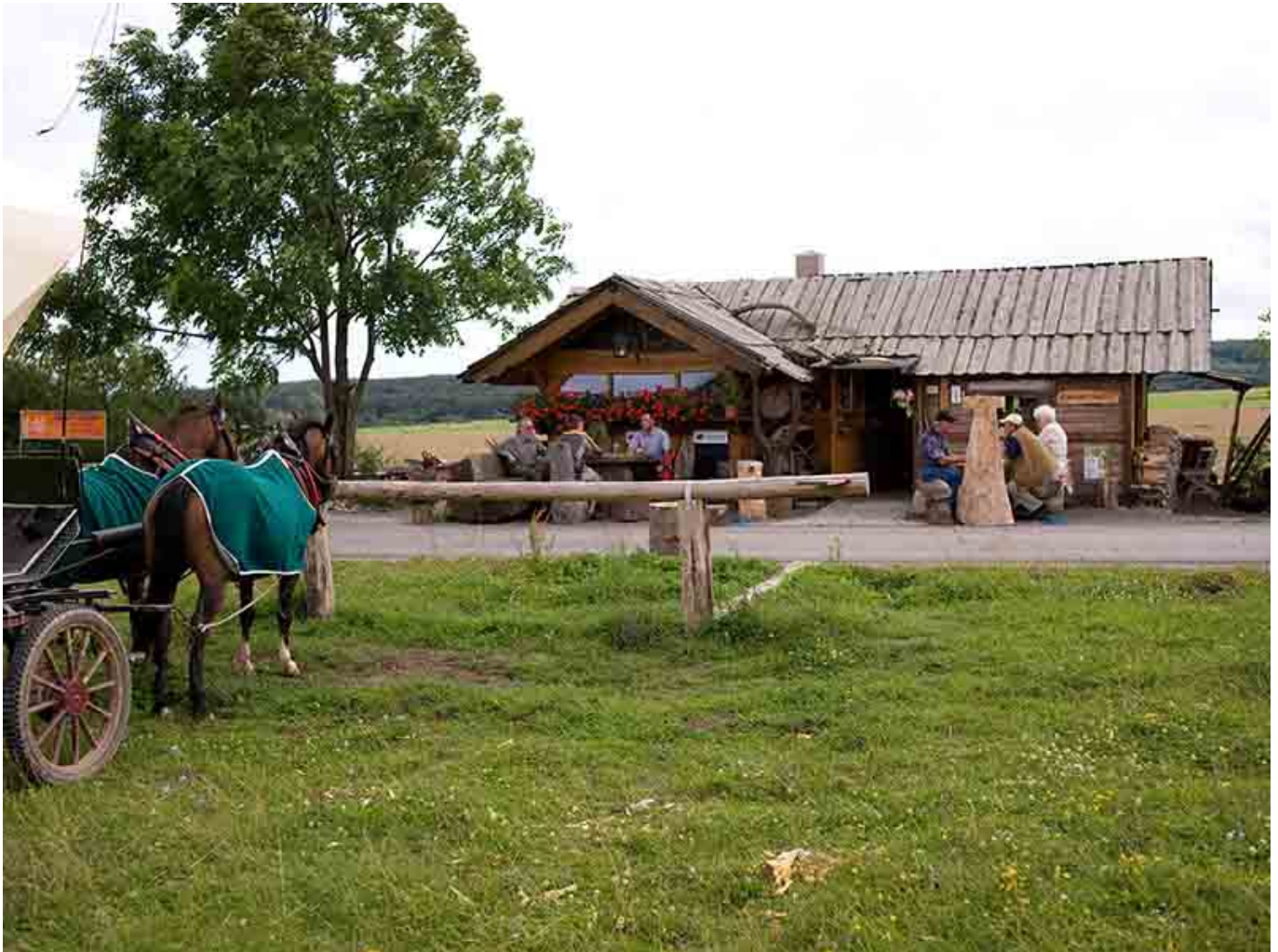
Hainichbaude am Craulaer Kreuz