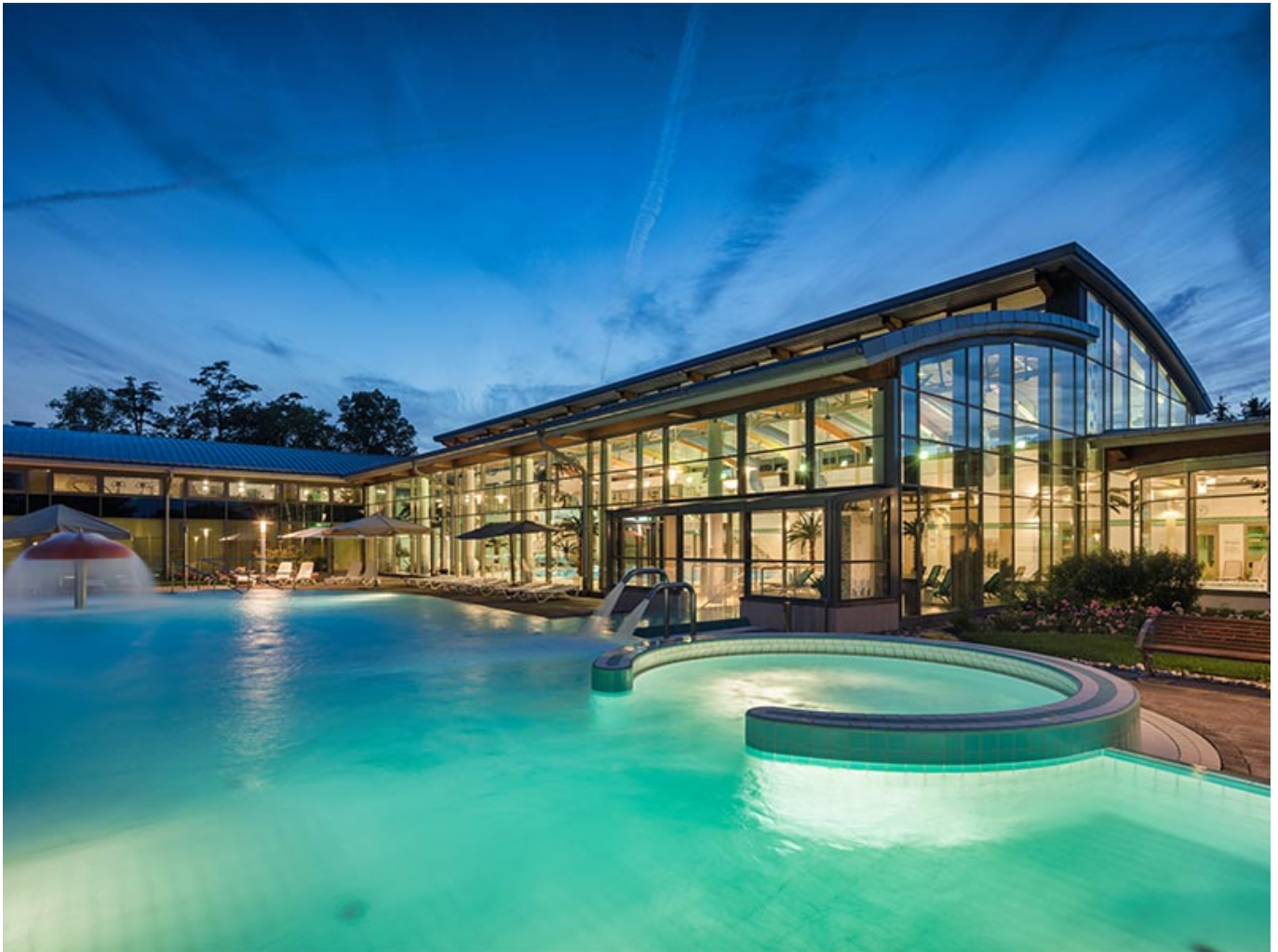
Friederiken Therme Bad Langensalza

A visit to the Friederiken Hot Springs in Bad Langensalza is balsam for body and soul. Gentle recuperation is the order of the day here, incorporating the effects of natural healing remedies.