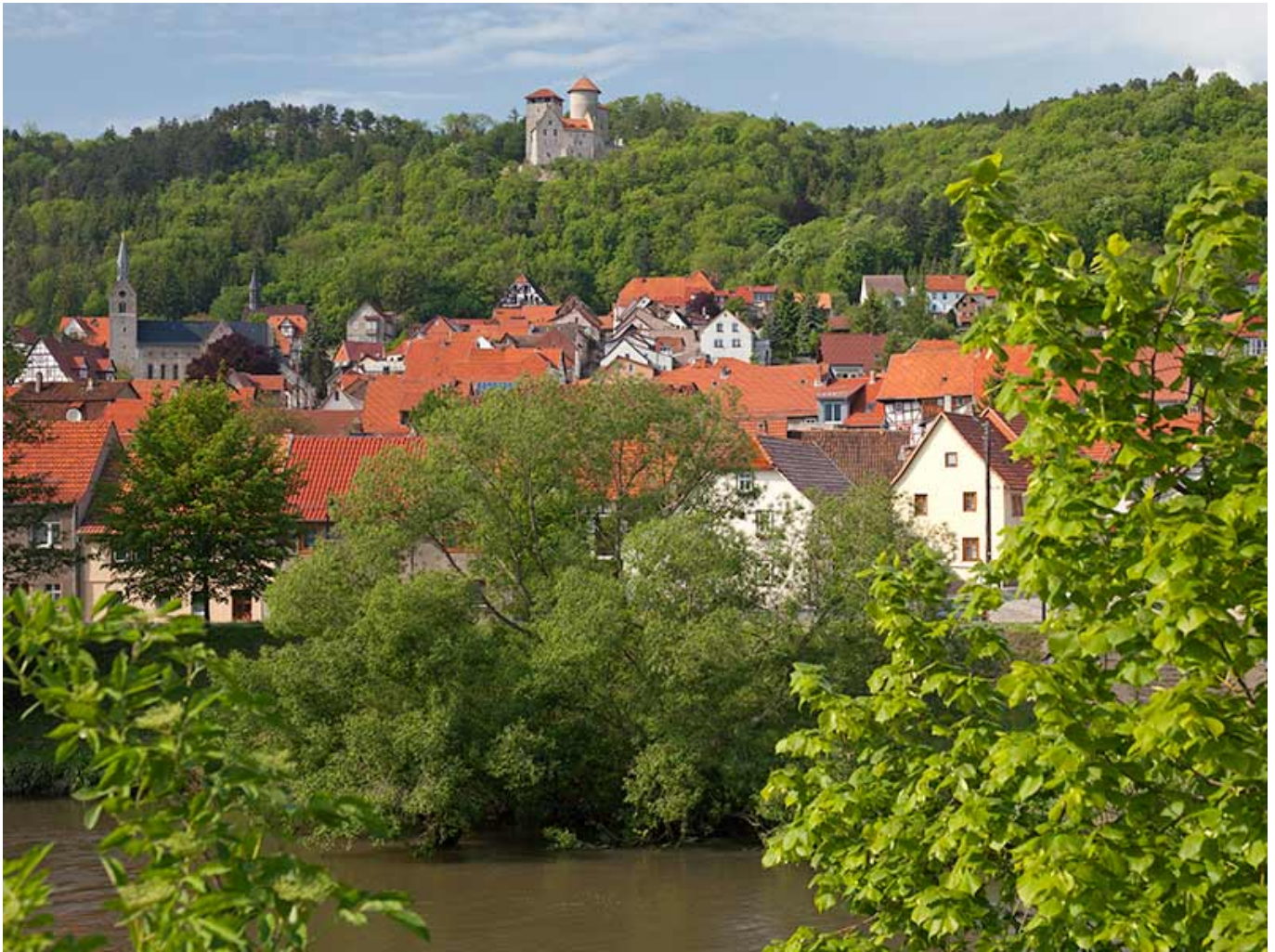
Treffurt mit der Burg Normannstein